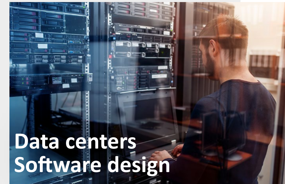
Data centers Software design