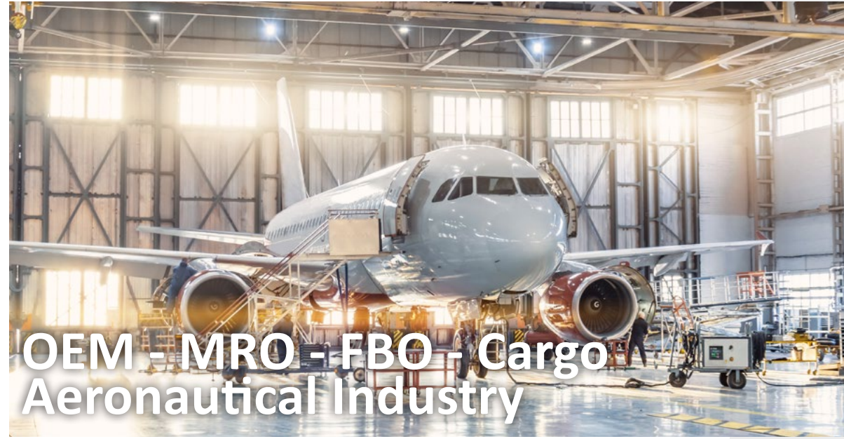
OEM - MRO - FBO - Cargo Aeronautical Industry