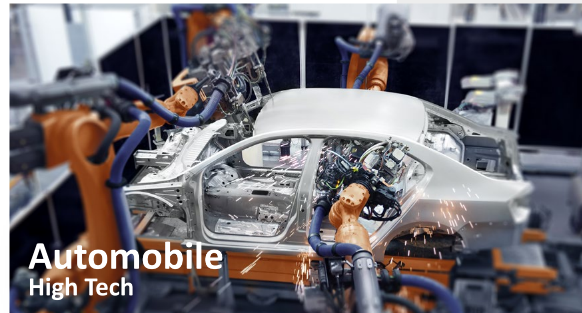
Automobile High Tech